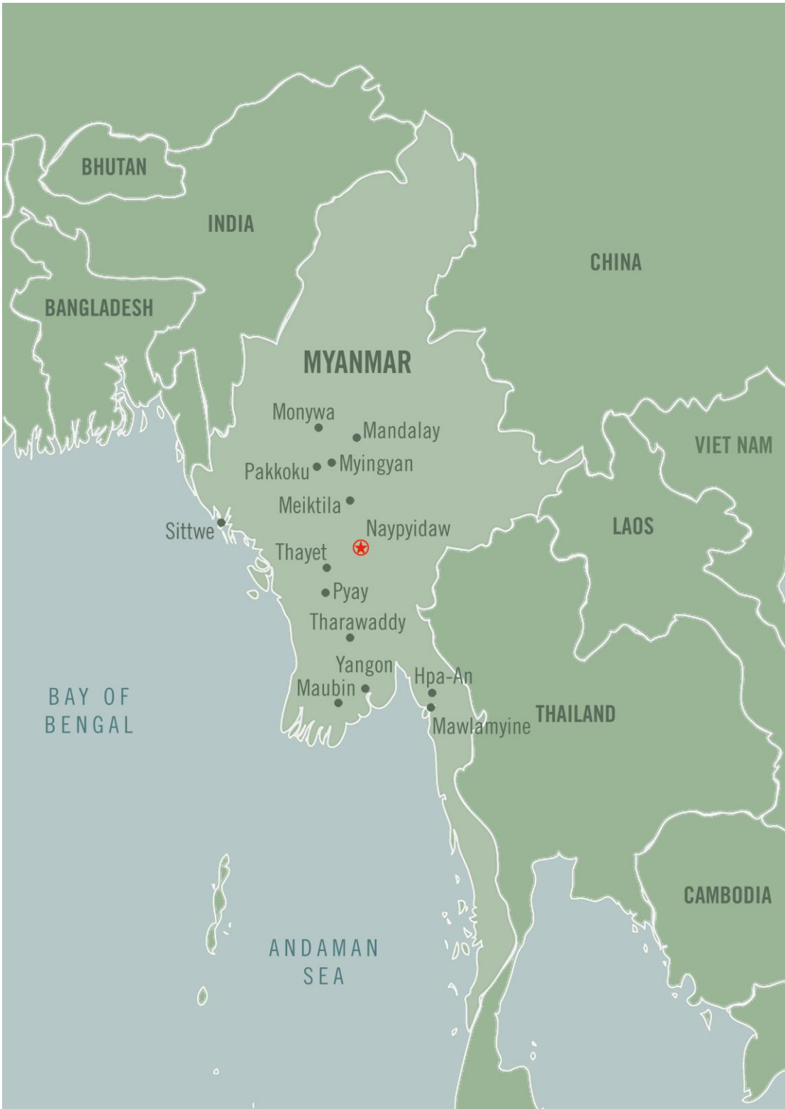
Map showing towns and cities in Myanmar where prisoners of conscience and political prisoners who feature in this report have been or are imprisoned.