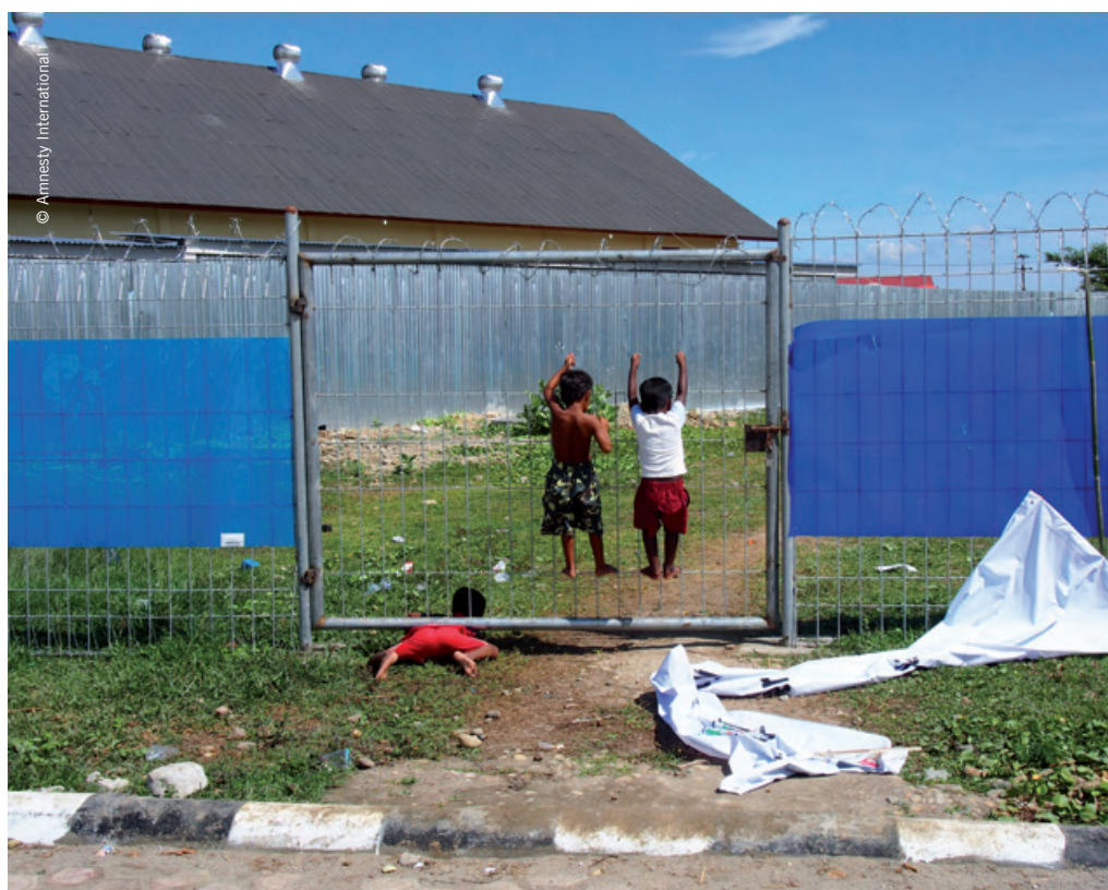
Three Rohingya boys at a shelter in Aceh.

A large proportion of the recently arrived Rohingya are children; of a population of 950 people, 521 – or 55% – are children, and 328 – or 34% – are unaccompanied or separated. 176 Although the sites where the Rohingya are living in Aceh are not officially called detention facilities, in practice the residents’ movements are often restricted and they could be understood as being detained. Amnesty International is concerned at the ongoing detention of any children, as detention is never in their best interests. 177 The long-term effects of immigration detention on children are well known; in one recent study, a third of children detained by Australia were suffering from a mental health disorder requiring psychiatric support. 178