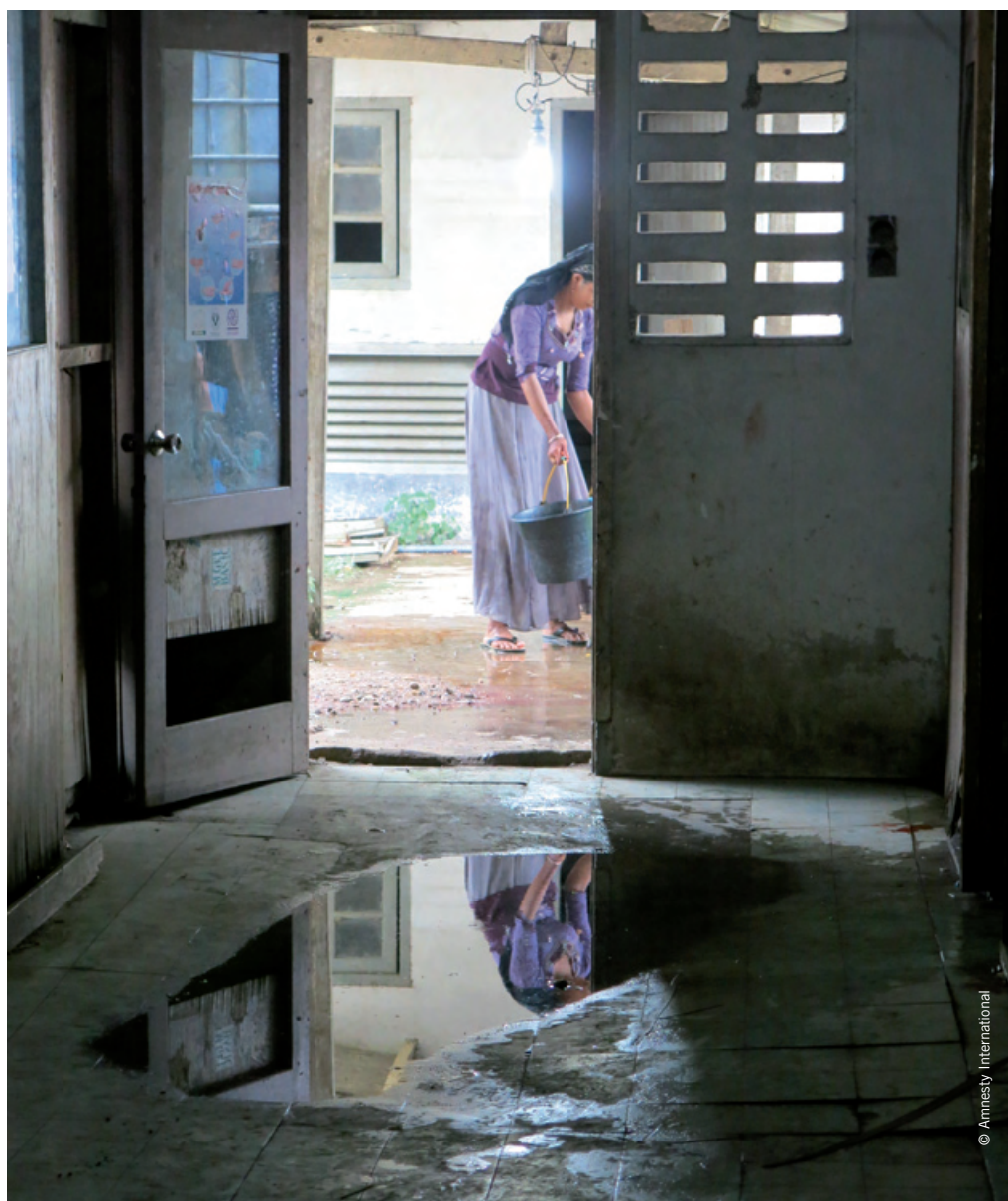
The hallway of the women's quarters at a shelter for Rohingya asylum-seekers in Aceh.

Several weeks after Amnesty International's research at the Blang Adoe shelter in Aceh, there were media reports about the beating and rape of the Rohingya by local residents. Following the alleged rapes, including of a 14-year old girl, more than 200 Rohingya left the shelter but eventually returned. At the time that this report was being finalized in mid-October 2015, local police said that they were investigating these reports. 181