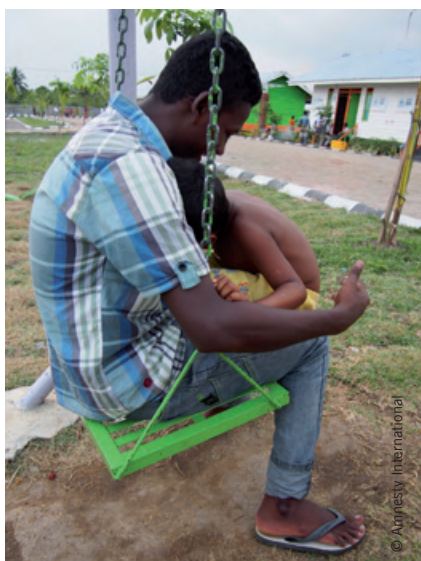
A Rohingya man and child at a shelter in Aceh.

In May 2015, Indonesia permitted the disembarkation of approximately 1,800 people in Aceh who had been stranded at sea in three boats. Of this group, UNHCR registered about 1,000 Rohingya asylum-seekers from Myanmar, 143 115 of whom spoke with Amnesty International. The remaining passengers were determined to be Bangladeshi migrants, and their gradual repatriation is being carried out with the assistance of IOM. As of 10 August 2015, the recently arrived Rohingya were being housed in five locations in Aceh and North Sumatra provinces: 315 in Lhokseumawe, 102 in Kuala Langsa, 159 in Lhok Bani, 331 in Bayeun, and 43 in Medan. 144