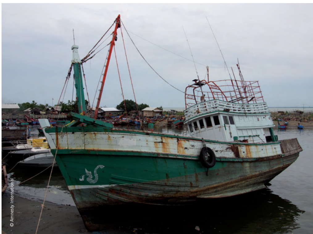
One of the three boats to reach Aceh in May 2015. It carried 578 Rohingya and Bangladeshi passengers, who were rescued by local fishermen.

In May 2015 three boats carrying 1,800 women, men and children grounded in Aceh in Indonesia. The vessels were among the many boats that had been abandoned by their crews following the regional crackdown on trafficking, leaving thousands of passengers stranded at sea for weeks. The majority of those on the boats were Rohingya who had fled Myanmar. All those who arrived at Aceh were weak with hunger, exhaustion and fear. They had endured weeks or months at sea, in boats controlled by ruthless people traffickers or abusive smugglers. This chapter discusses the conditions they were fleeing in Myanmar.