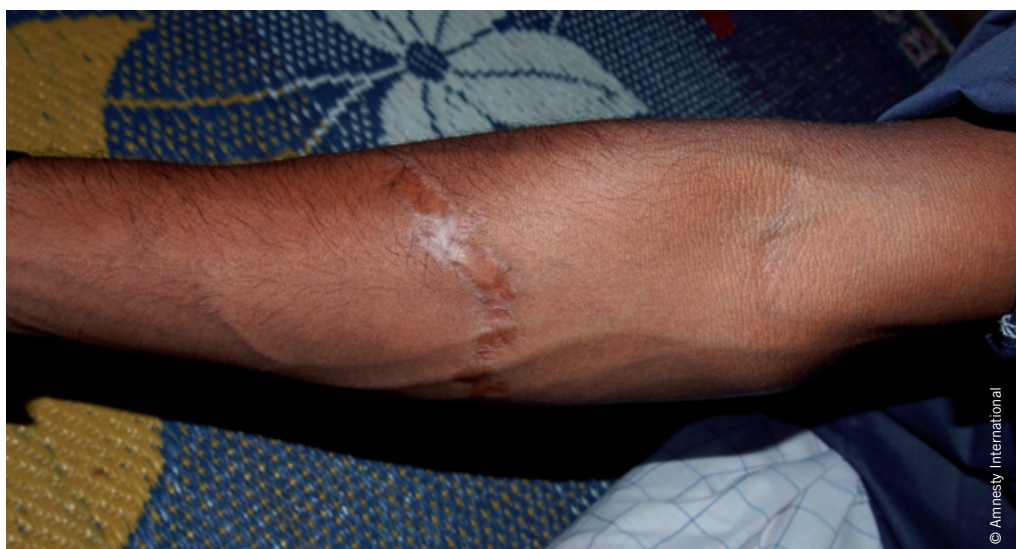
A Rohingya man showing a scar he said he sustained from a knife attack that took place in Myanmar in 2012.

Several interviewees said that their family members were killed and/or disappeared during the 2012 violence. A Rohingya businessman from Molek told Amnesty International that his 50-year old aunt was killed by police in June 2012; an eye-witness told him that she was stabbed with a knife in her side, and her body was taken to the monastery but never released to her family. At around the same time, his two teenage nephews were captured by a mob and never seen again. He called the police to inquire about his nephews' whereabouts, but the officer told him: " Kala , I cannot do anything for you." 31 A 19-year old woman from Sakki village said that in June 2012 her husband received knife wounds during the attacks, and she believes he died: "We cannot find his dead body. It disappeared." 32 A woman from Santolli village told Amnesty International that her eight- and seven-year old children disappeared during the June 2012 violence; she fears that they are dead, saying: "I never saw their bodies." 33