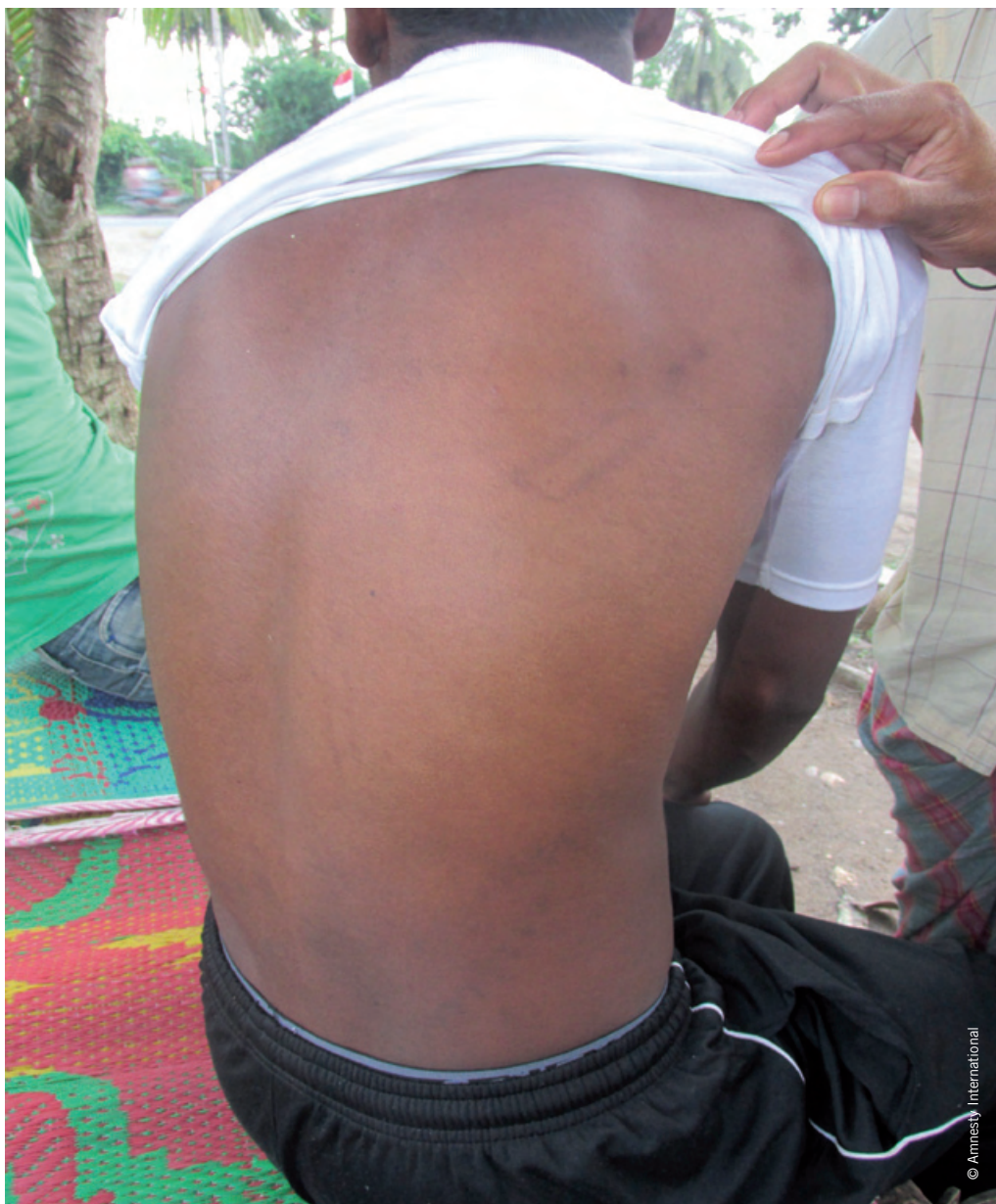
A 21-year old Bangladeshi man showing a scar he said he sustained from severe beatings on board a large vessel that stayed near the Thai coast for seven months.