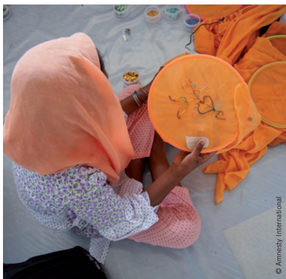
A Rohingya girl practising her embroidery at a shelter in Aceh.